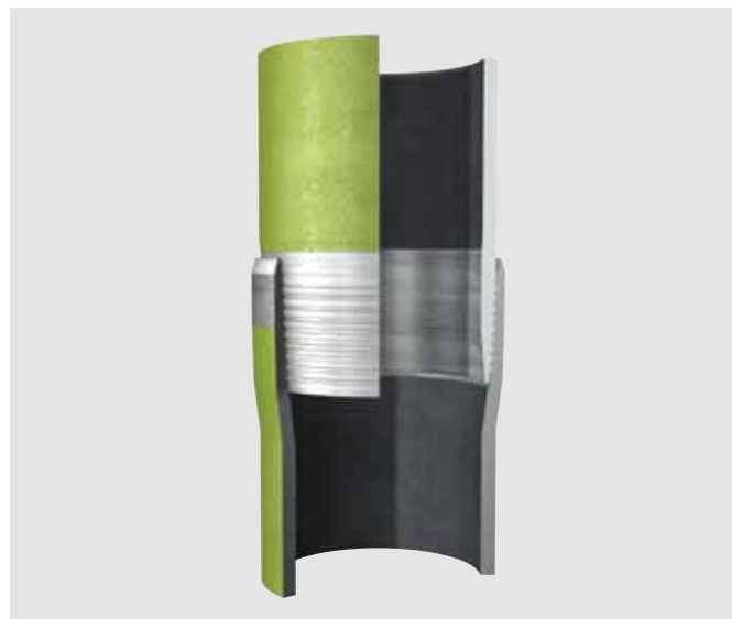
▲ TenarisHydril Wedge 521™ was run safely in triple stands in Ghana.

After make-up, each stand of three was lifted clear of the hole and the pipe racking system was moved into position at the drilling derrick. The stands were racked back in the drilling derrick, ready to be run into the drilled hole after it was determined whether a wiper trip was needed. Having the stand racked back at the drilling derrick in a position that made it accessible to both pipe racking arms would save both valuable running time and money.